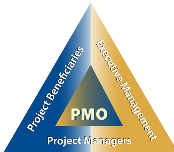
Figure 1: Who determines the PMO's value?

It might seem that each group has an equivalent scope of influence over your PMO, when in fact, it is not true. We believe that project managers, as a group, have the strongest influence in determining whether the PMO is perceived as having value. After all, the PMO, in most implementations, is created specifically to help project managers perform their roles better. If the primary audience for whom the PMO was created fails to see the value in its work, it is highly likely that others in the organisation will fail to see it as well.